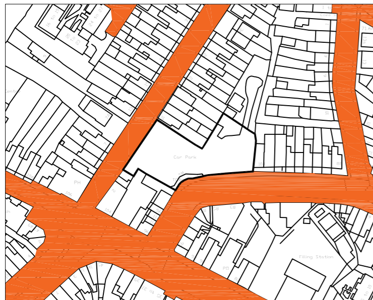
Adoption Plan Scale 1 : 1000