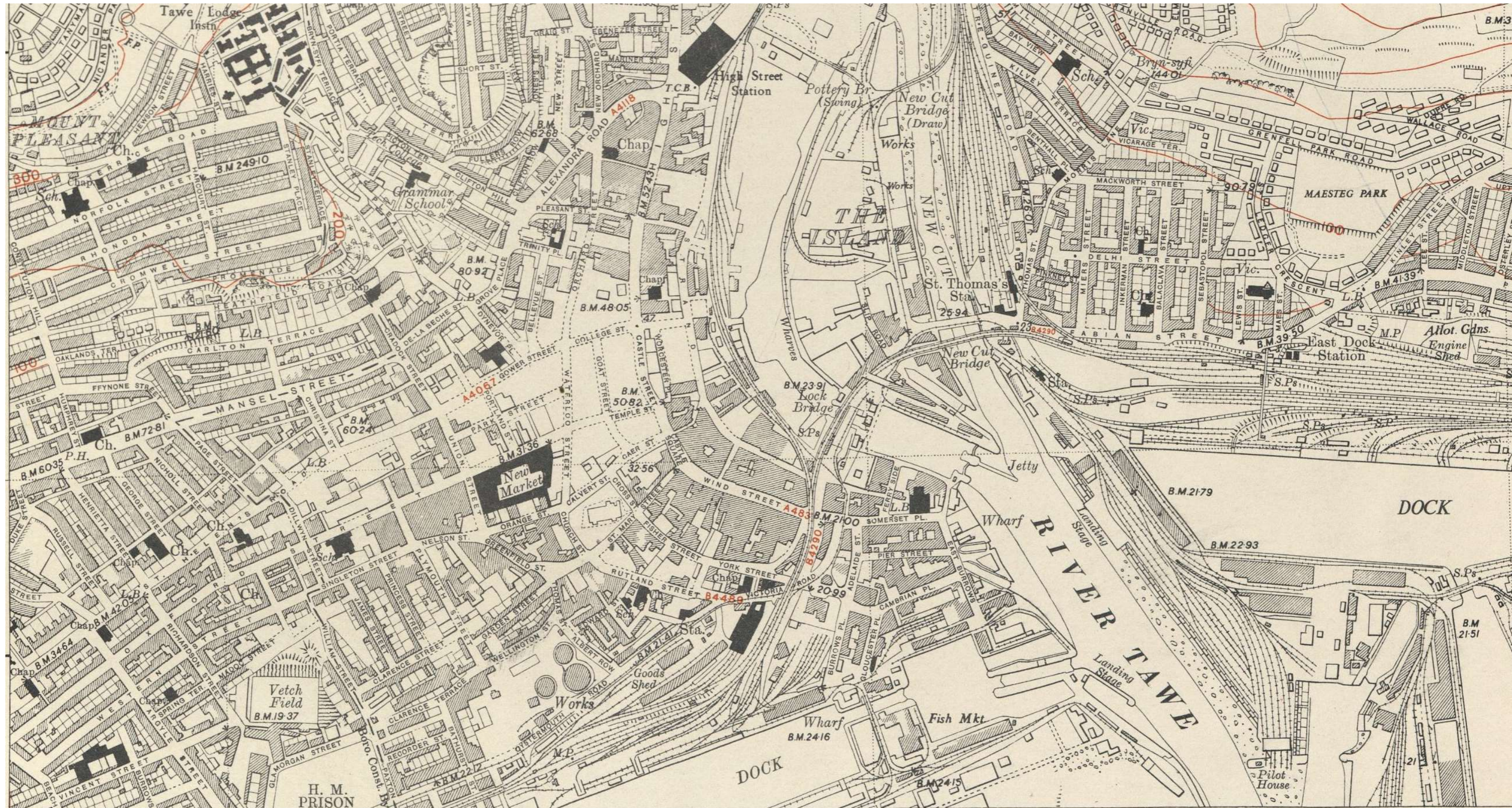
Figure 4: Map of Swansea after the Three Nights' Blitz