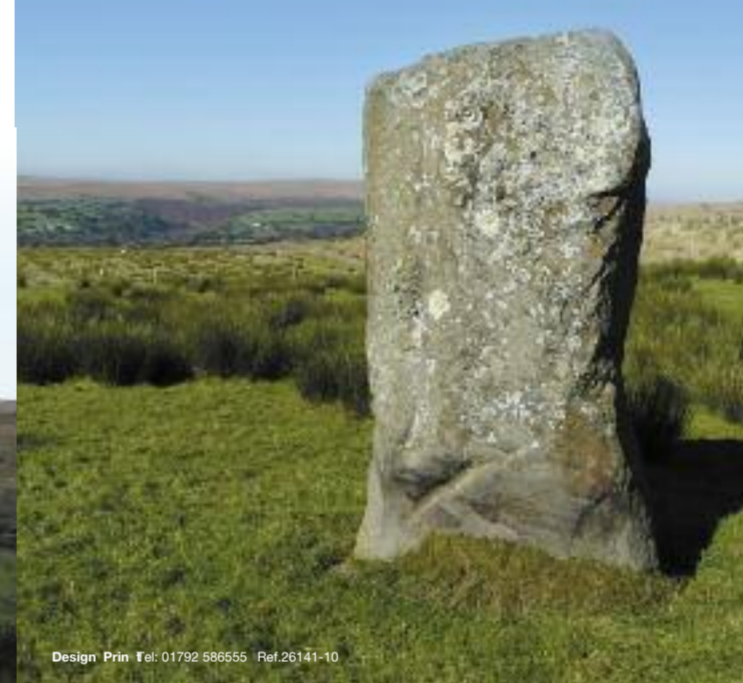
Design Print Tel: 01792 686555 Ref: 20141-10