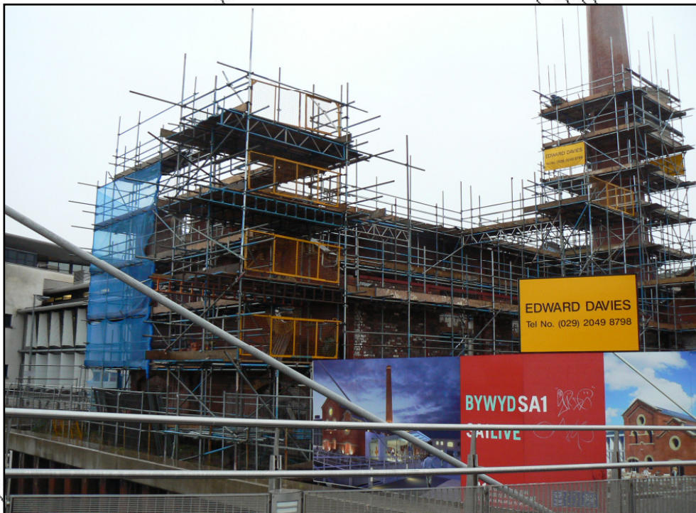
Diagram for the Flagship Building 029 2049 8798