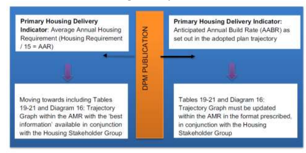
Figure 1: Extract from the DPM on the Monitoring Method to be Followed for Housing Delivery

3.16 The DPM requires Local Planning Authorities to chart and tabulate actual completions against the 'straight AAR line', and forecast the timing and phasing of sites/supply in the remaining years of the plan period.