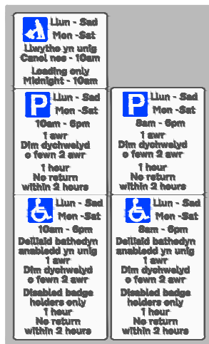
Sign Type B